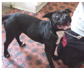
Nina is available for adoption! See her profile inside!

Madam's Organ. And we just had a pizza fundraiser where we all ate too much---but, hey, it is for a good