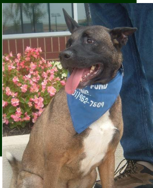
Jack is available!

Please inquire at your workplace for information on signing up for this program.