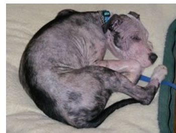
Jasper getting his fur back!

Jasper and Darwin are just two of our many "urgent" cases, dogs that require a little special care, a little extra money, to get back on their feet!