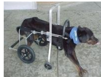
Darwin gets around in a doggie wheelchair!