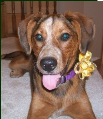
Sydney is available for adoption!

Blush was named for her beautiful color, but if she was named for her personality, her name would be Joy! She loves everyone she meets, and is always happy. Blush plays well with other dogs and kids. She is calm and tolerant, and that's impressive for a 9-month puppy! Blush is ready for her forever home, and will make everyone around her smile!