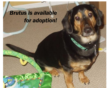
Brutus is available for adoption!

Saturday - May 26th 10am - 4pm Lake Forest Mall