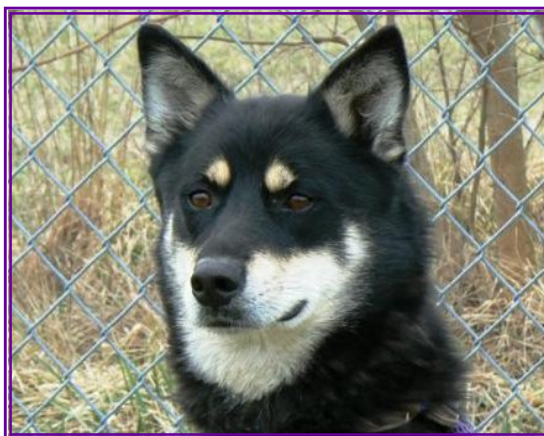
Tu-se is Cherokee for "speaker" and he is available for adoption!

Do you use a search engine while online? And do you love dogs? Well, then check out Roxie's Fund's GoodSearch!! GoodSearch is a search engine powered by Yahoo! so you know it's good.