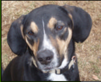
Champ, a Doberman hound mix, is waiting for his forever home!

On March 1-2, 2008, the Catoctin Kennel Club hosted the Chesapeake Siberian Husky Club's breed specialty show. Roxie's Fund was given the opportunity to have a concession stand at the event as a fundraiser. We heartily agreed!