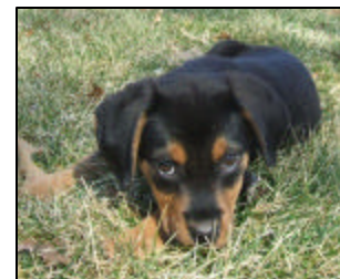
Aretha (left), Miles (top) and Ella (bottom)

And then we got the news that all rescues dread—the puppies had the highly contagious and deadly parvo virus. Many rescues choose to humanely euthanize puppies with parvo because it is so expensive to treat. Roxie's Fund refused to euthanize these special holiday puppies—instead hoping that these puppies would survive another