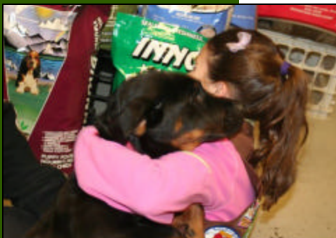
One of the "jazz singers" puppies gets lovin' from a Girl Scout.