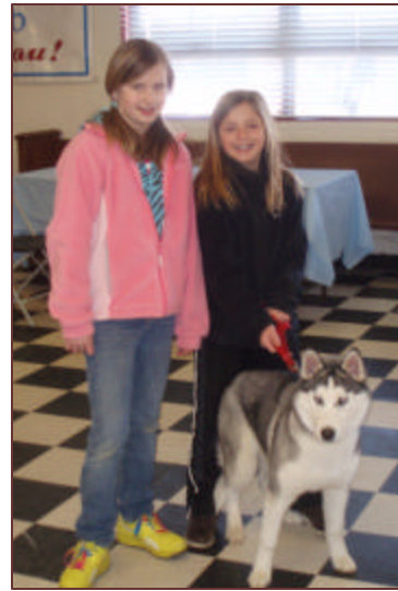
Kids who are kind to animals are the future we want to see!