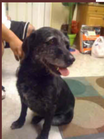
She's so Raven!

Don't let the salt and pepper fur fool you— Raven is an active and playful girl! She would not be caught home playing bridge, if you know what I mean! She appears to be a Wire Haired Terrier/Lab mix. This spirited girl would make a great companion to any family! She enjoys the simple things in life - a walk, a cuddle, a car ride.