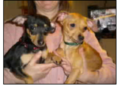
Bitsy and Botsy are two cool dogs available for adoption!

Check www.humanesociety.org for more summer pet tips!