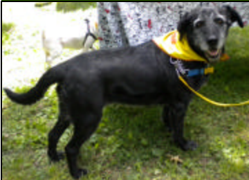
Raven, available for adoption, at Cheverly Day!

Check our website for future adoption events in July and August!