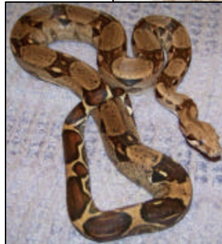
Baby (above) and Mango (left) are available for adoption through our reptile program!