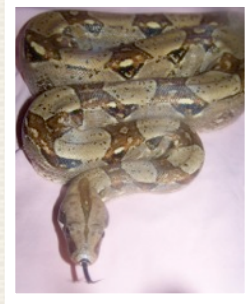
Enzo (dog) and Coco (snake) are available for adoption.