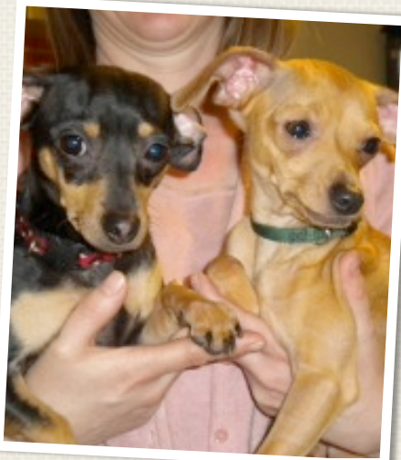
BITSY & BOTSY

Sadie is a wonderful dog who happens to be a pit bull! She needs a family willing to "not judge a book by its cover"! Sadie would work out well in nearly any situation because she is very easy-going. She plays well with other dogs, she's loving, and she's a fast learner. Sadie wins over people wherever she goes! Wouldn't you like to meet this cutie?